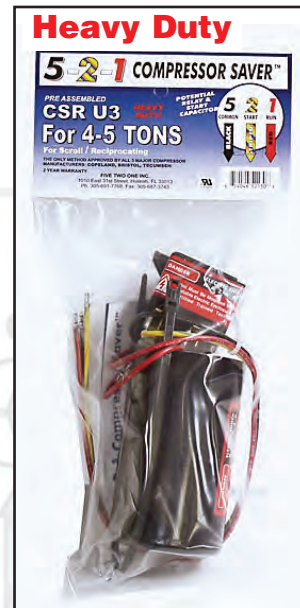
CSRU3 For 4-5 Tons For Scroll/Reciprocating