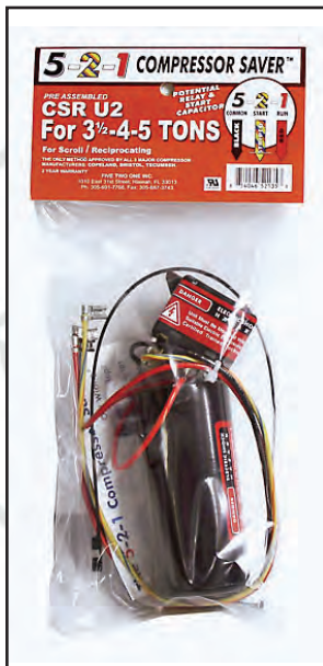
CSRU2 For 3 1/2-4-5 Tons For Scroll/Reciprocating