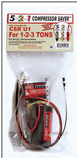
CSRU1 For 1-2-3 Tons For Scroll/Reciprocating